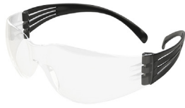
SF101AF-BLK 7100238174 Lens: Clear, AF/AS Frame Color: Black