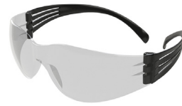
SF107AF-BLK 7100238257 Lens: Clear, AF/AS Frame Color: Black