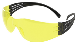
SF103AF-BLK 7100238183 Lens: Amber, AF/AS Frame Color: Black