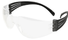
SF101AS-BLK 7100238173 Lens: Clear, AS Frame Color: Black