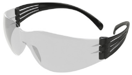
SF102AF-BLK 7100238172 Lens: Clear, AF/AS Frame Color: Black